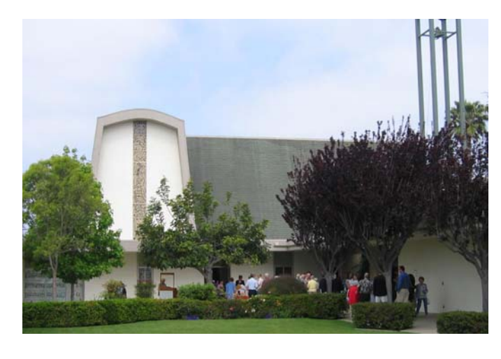
Community United Methodist Church 6652 Heil Ave Huntington Beach, CA 92647